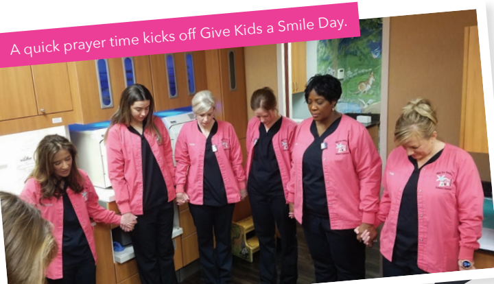
A quick prayer time kicks off Give Kids a Smile Day.

During this year's event, held Friday February 22nd, the office treated more than 20 children and provided procedures including: routine cleanings, dental examinations, radiographs, root