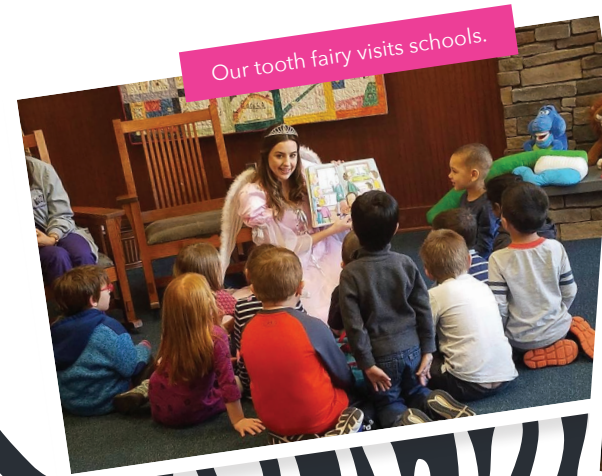
Our tooth fairy visits schools.