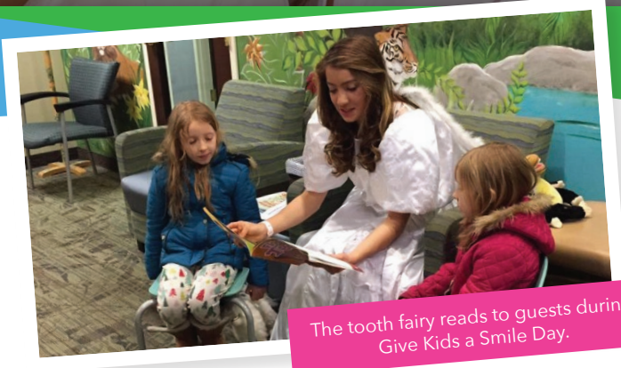
The tooth fairy reads to guests during Give Kids a Smile Day.